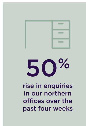
Figure 1 Carter Jonas Enquiry level trends, since January 2023 Enquiry levels are four-week rolling average

• Across our tracked Carter Jonas locations, enquiries have risen by an average of 5% over the past four weeks. However, the trend wasn't uniform. Our two northern offices saw a significant increase of nearly 50%, while London experienced a more moderate rise of 17%. Conversely, enquiries in our central offices declined by around 17%, and those in the south remained flat. This regional disparity in enquiries suggests both buyers and sellers are hesitant, likely due to the recent general election and the ongoing wait for mortgage rate decreases.