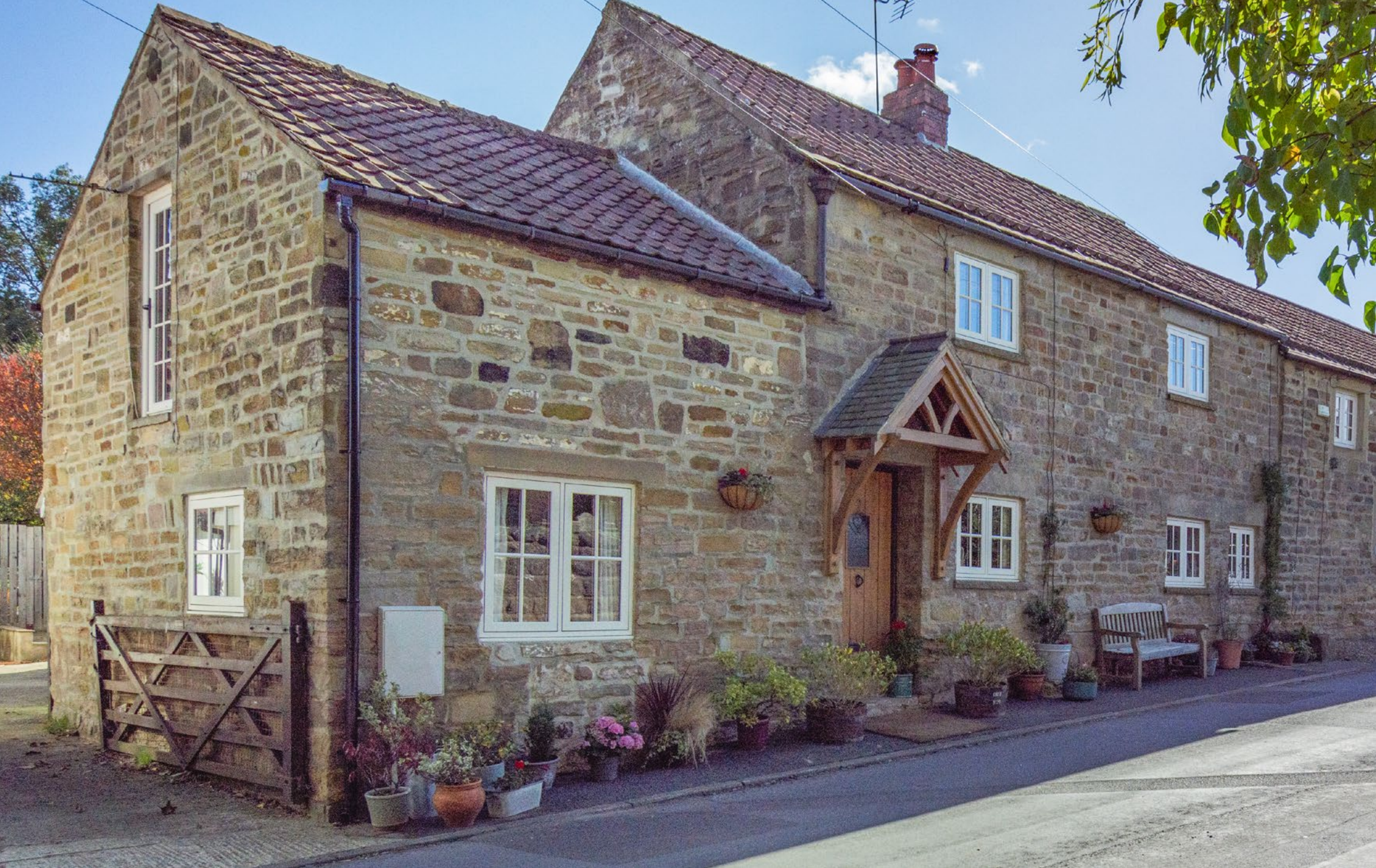
BEAULY COTTAGE Scotton