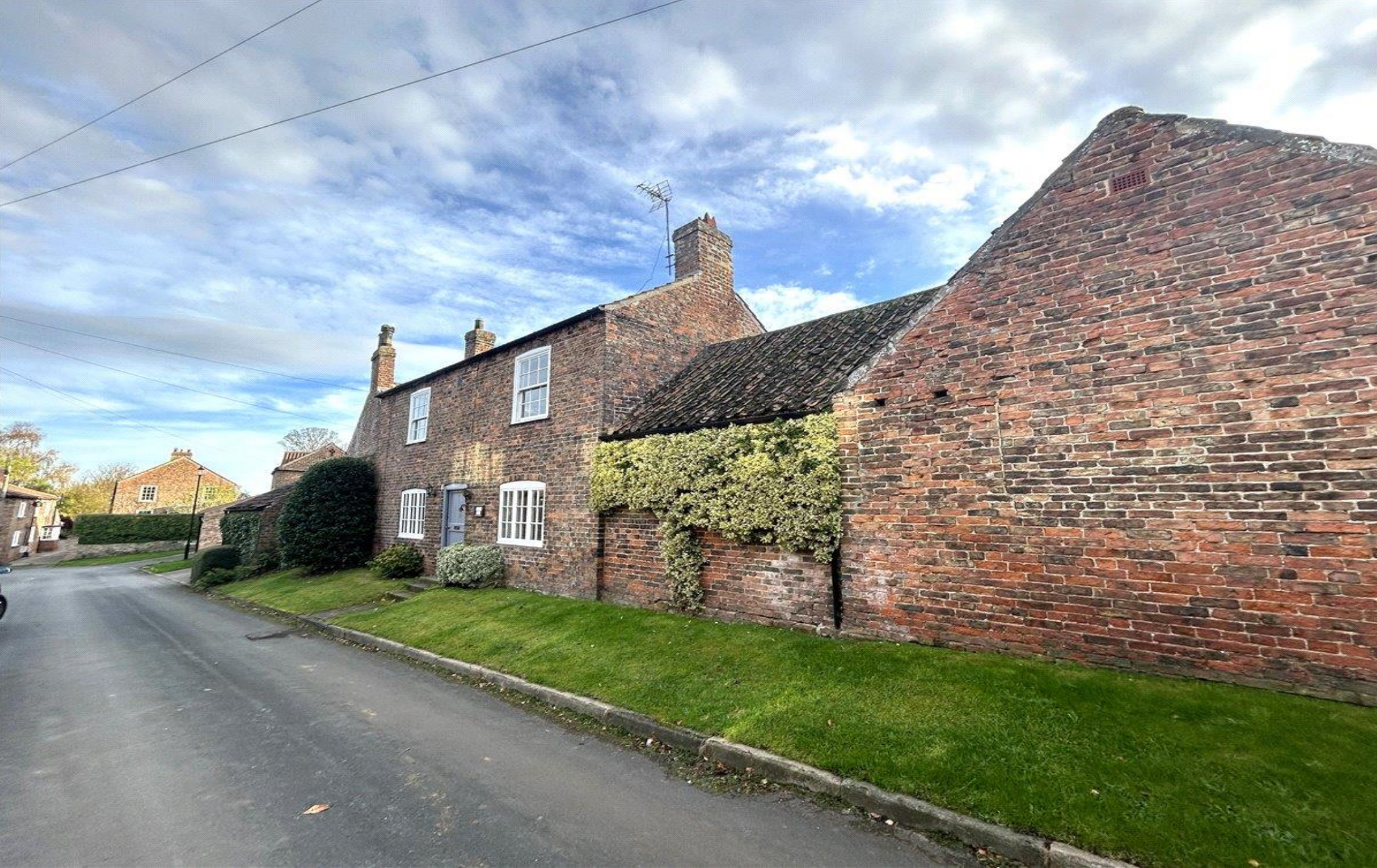
HILL TOP HOUSE, BACK STREET, ALDBOROUGH, YORK, YO51 9EU £1,300 per month