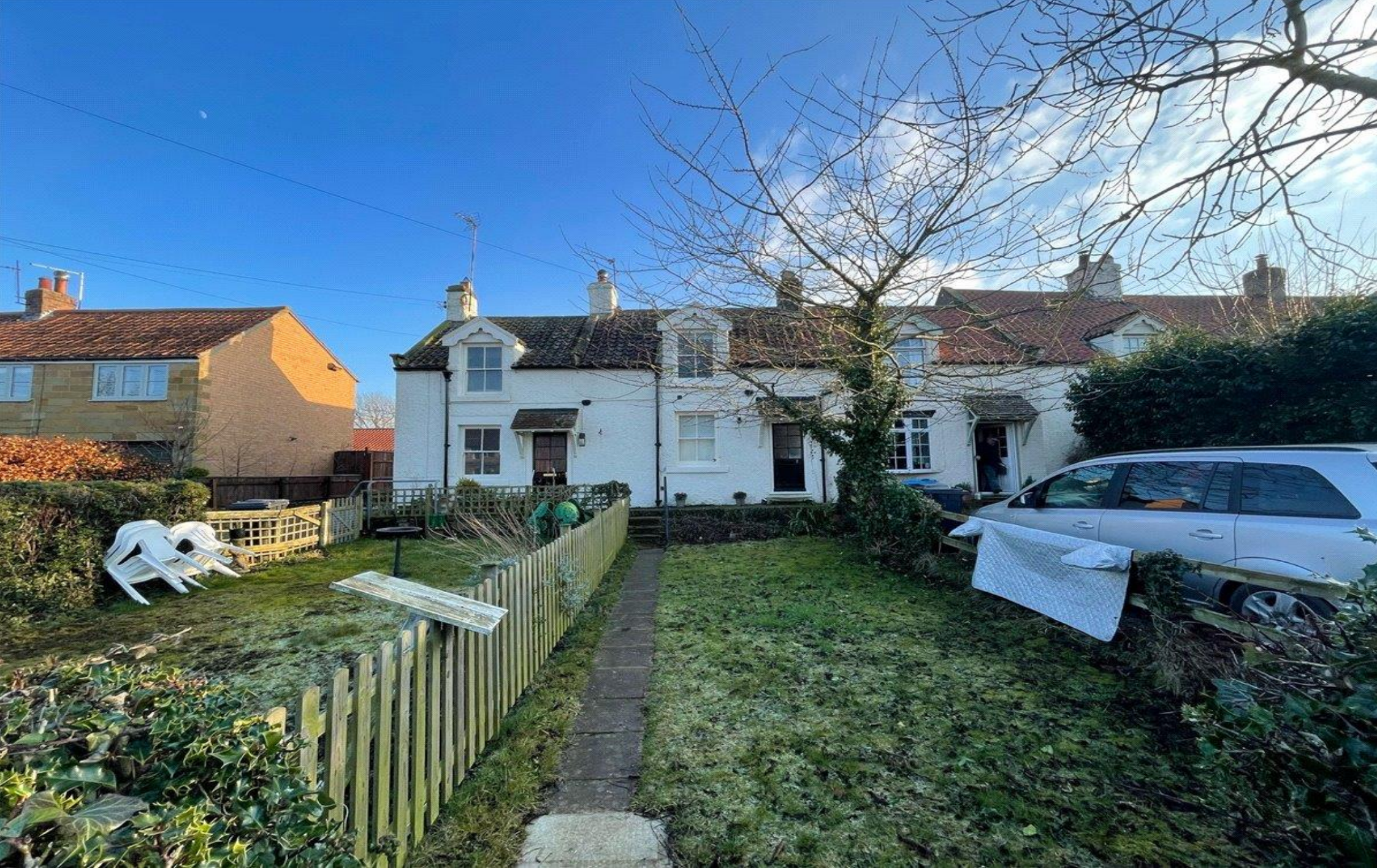
2 THE TERRACE, INGLEBY ARNCLIFFE, NORTHALLERTON, NORTH YORKSHIRE, DL6 3LY £875 per month