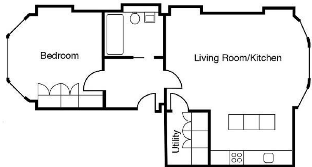
Apartment 4 First Floor 677 sq ft / 63 sq m

Mayfair Lettings 020 7493 0676 mayfair@carterjonas.co.uk 18 Davies Street, London, W1K 3DS