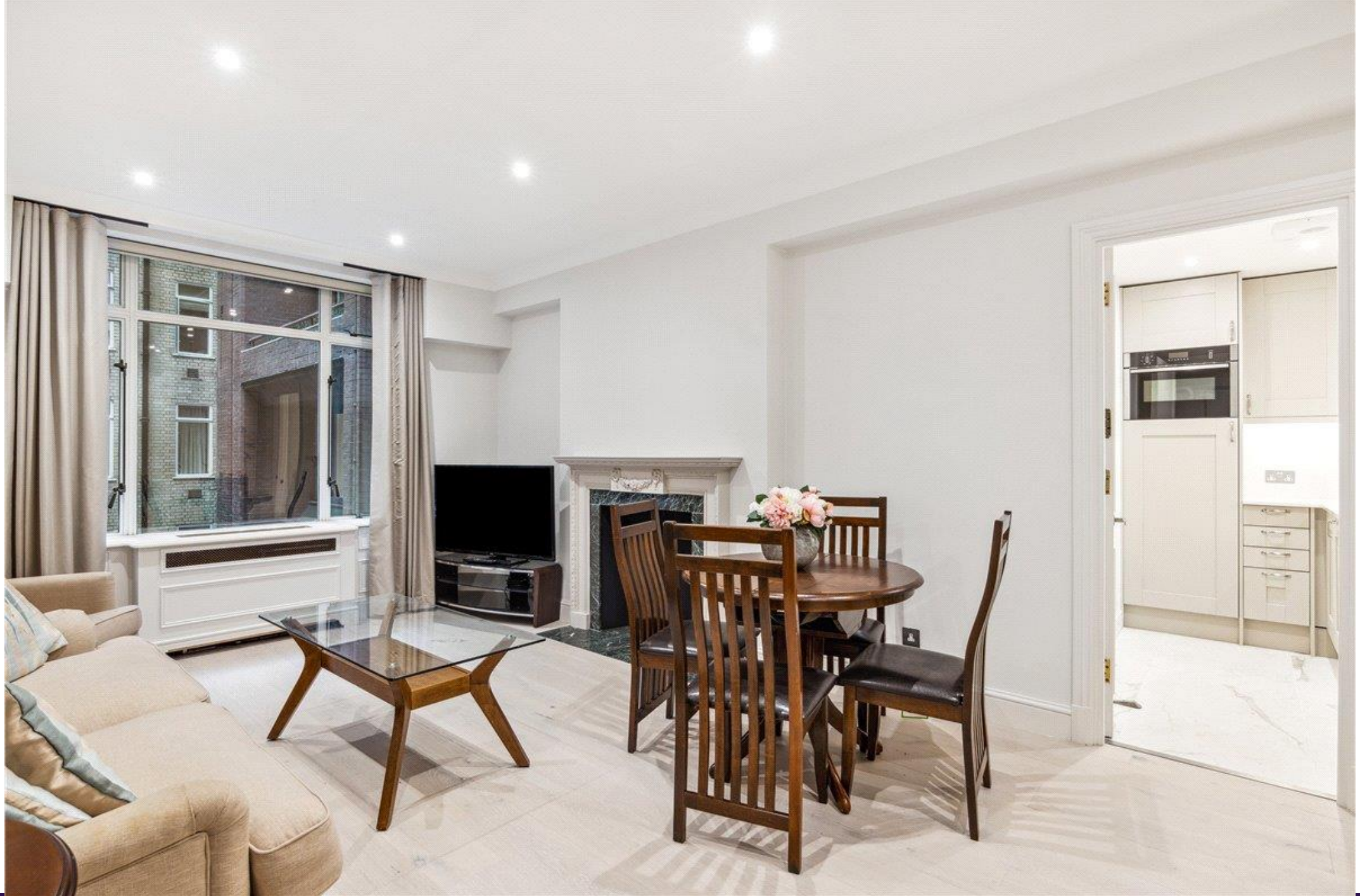
PARK LANE, MAYFAIR, W1K £1,153.85 per week*