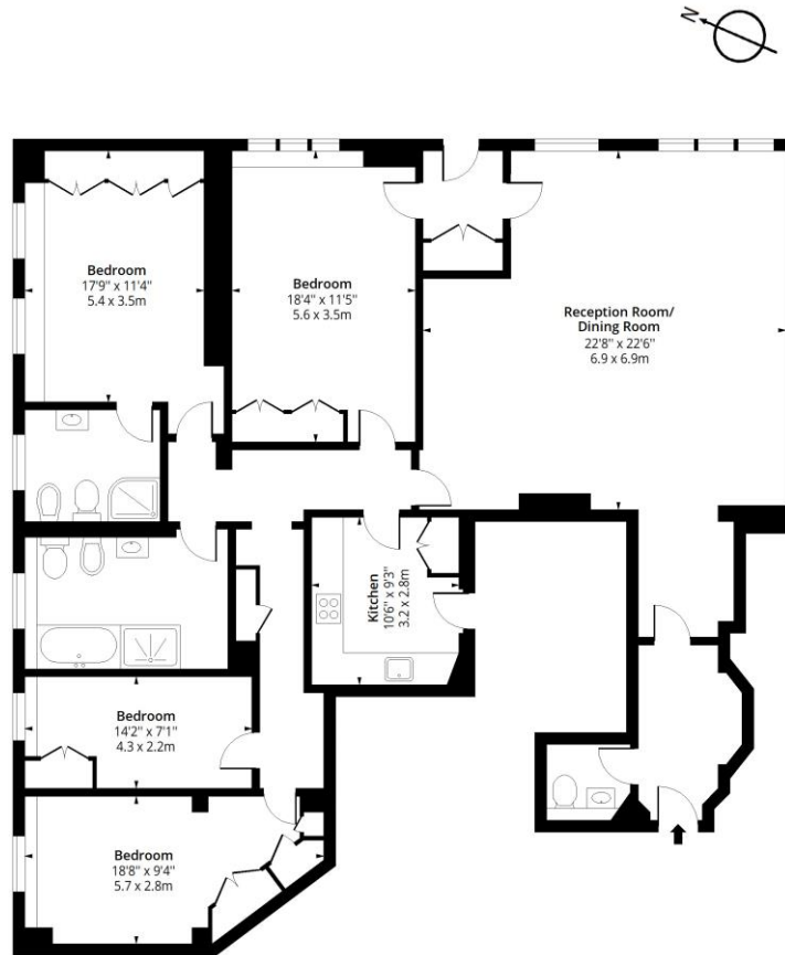
Ground Floor Floor Area 1779 Sq Ft - 165.27 Sq M