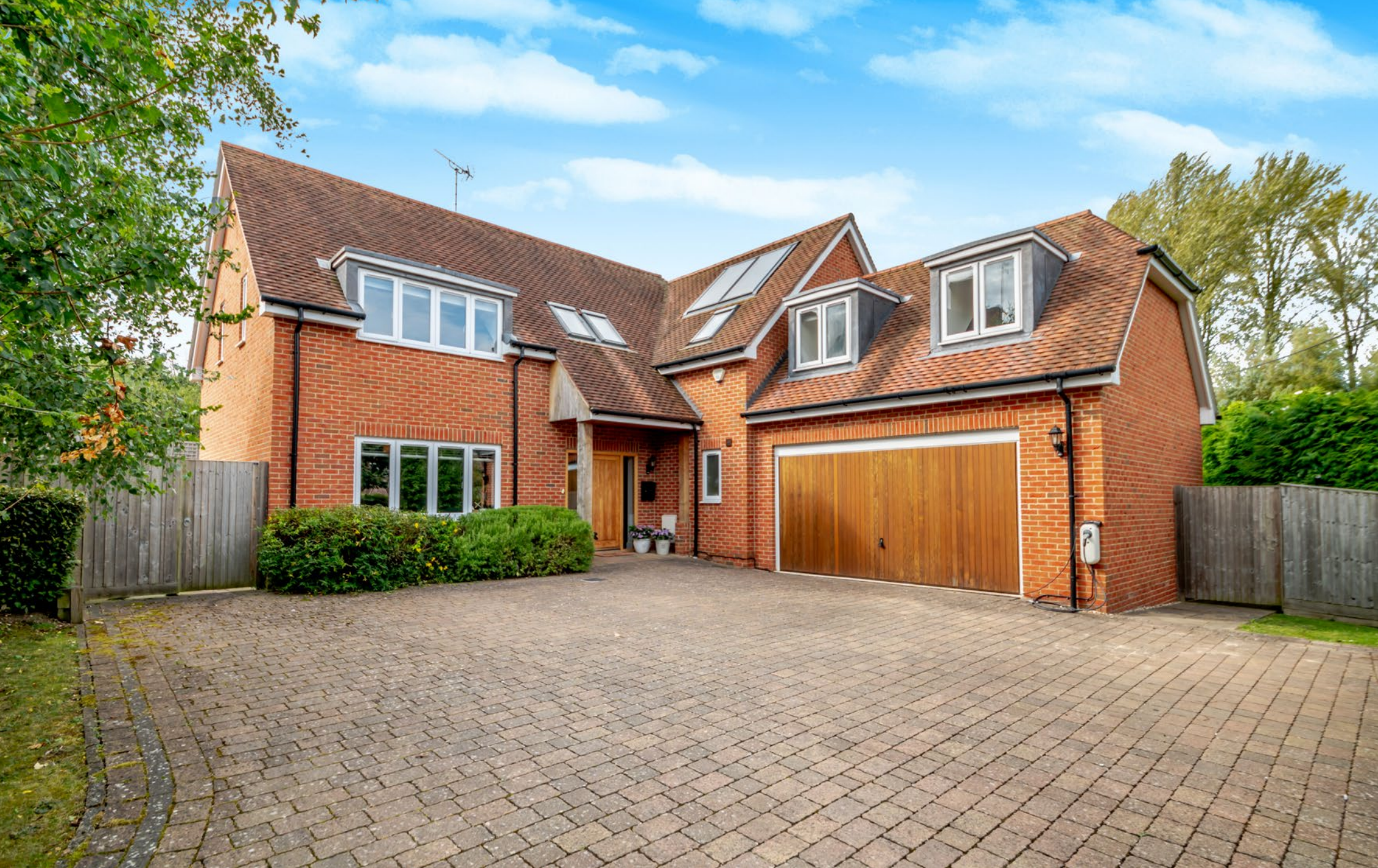
GRAMERCY HOUSE Guide Price £1,050,000