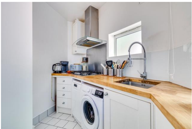
Classification L2 - Business Data