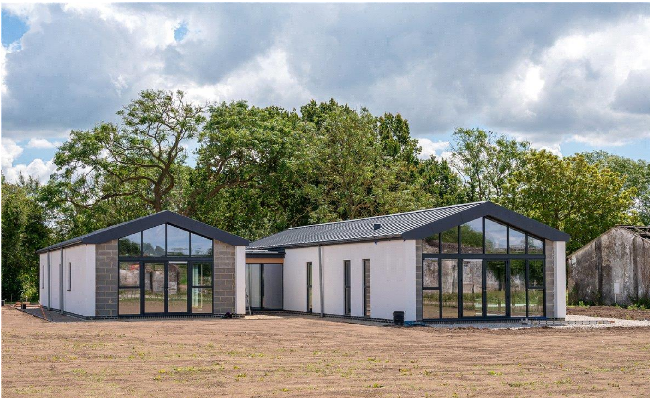
THE BUNGALOW, ROEBUCK BARRACKS, GREEN LANE, ACASTER MALBIS £850,000*