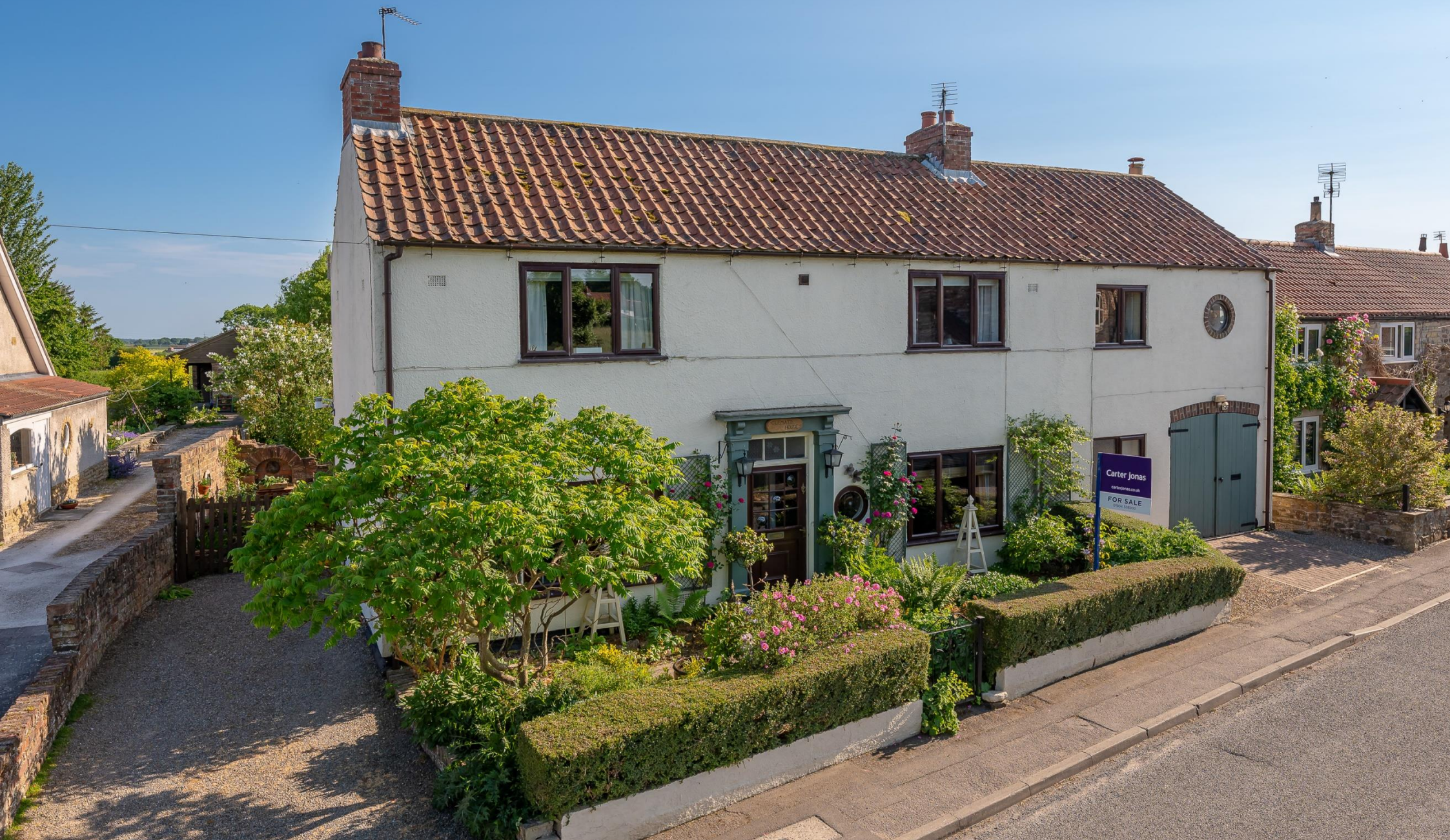
CLEMATIS HOUSE, LOW STREET, THORNTON LE CLAY, YORK GUIDE PRICE £575,000