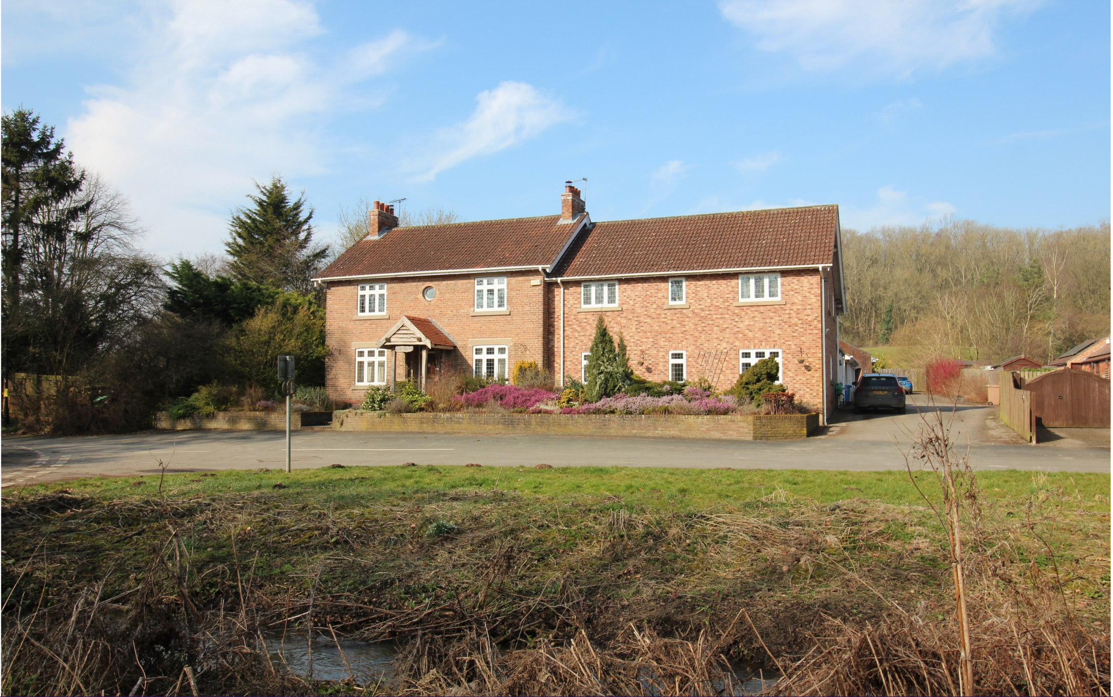
OAK LODGE, NUNBURNHOLME, YORK £1,100,000