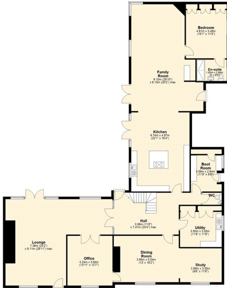
Ground Floor Approx. 250.8 sq. metres (2699.3 sq. feet)