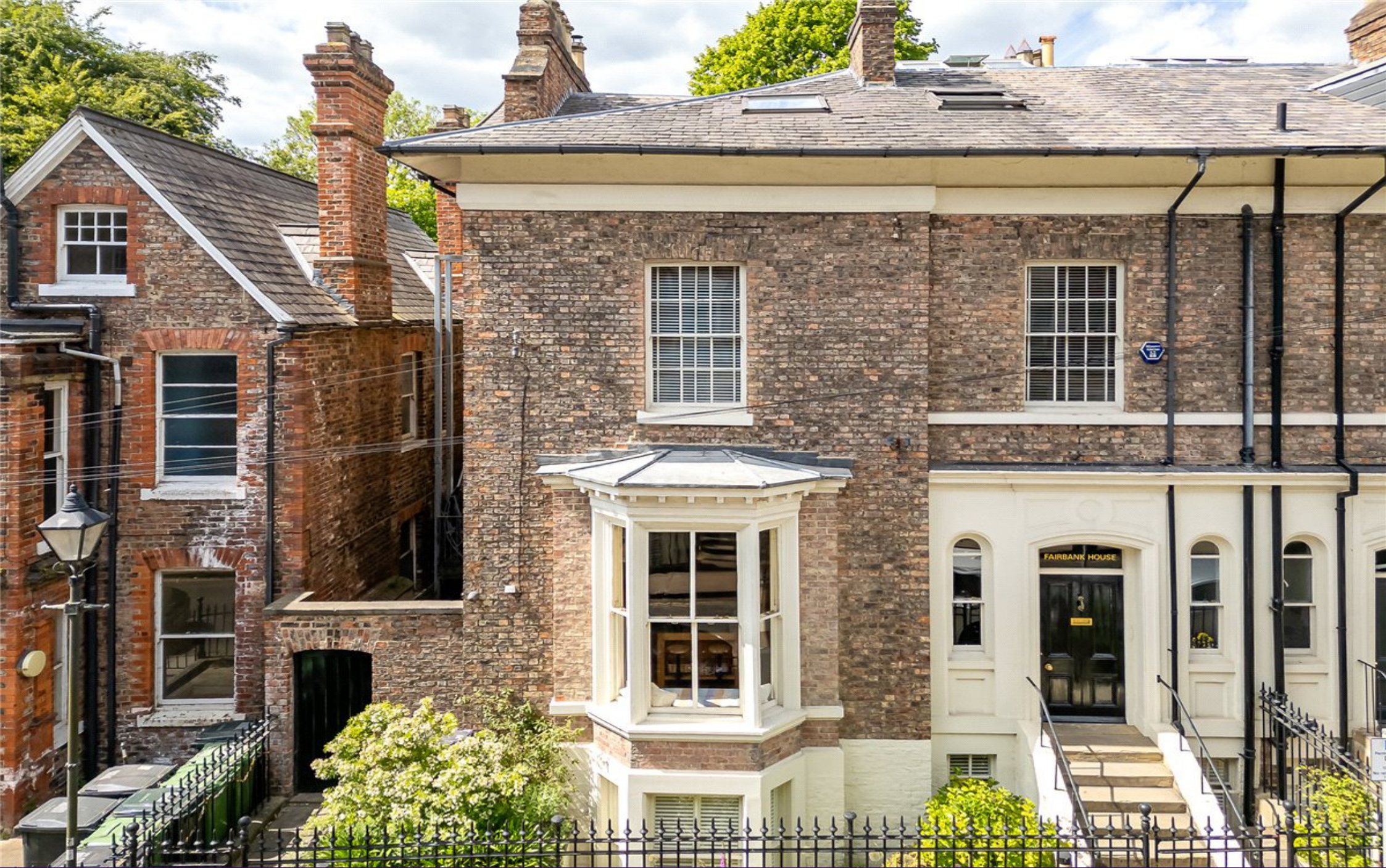
FAIRBANK HOUSE, ST. MARYS, YORK £1,900,000