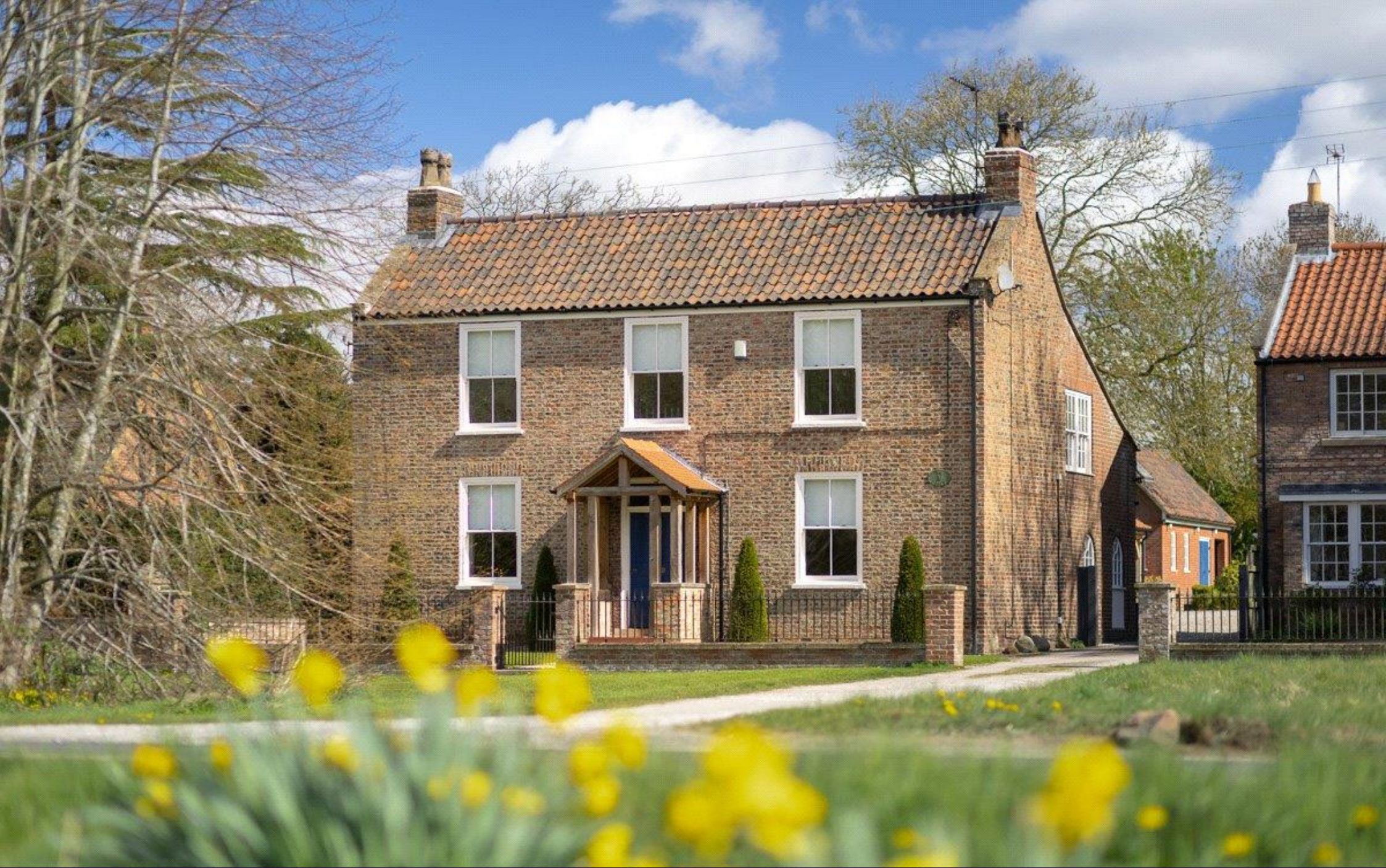
THE CROFT, FLAXTON, YORK £920,000